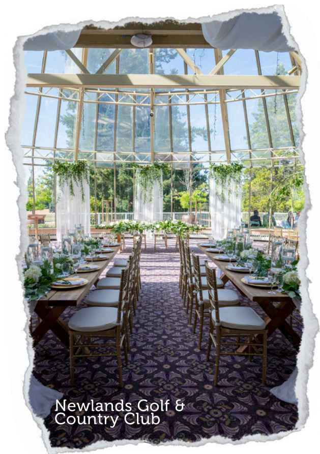
Newlands Golf & Country Club