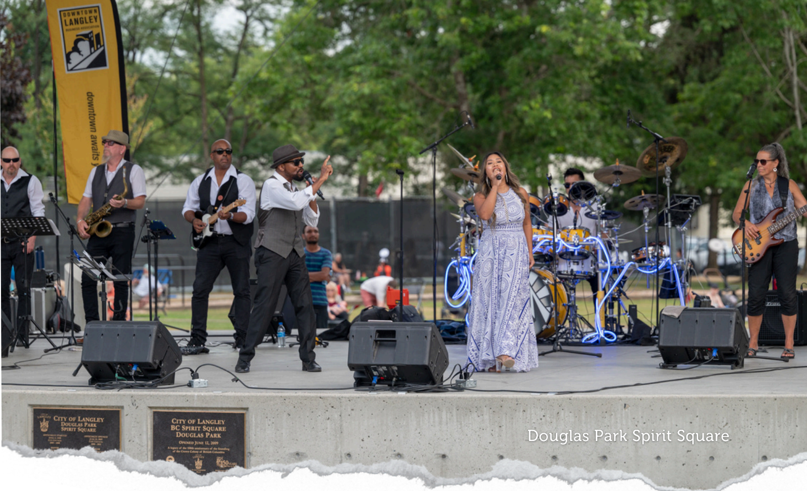
Douglas Park Spirit Square